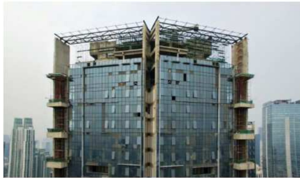
Crown Structure for Anandamaya Residence